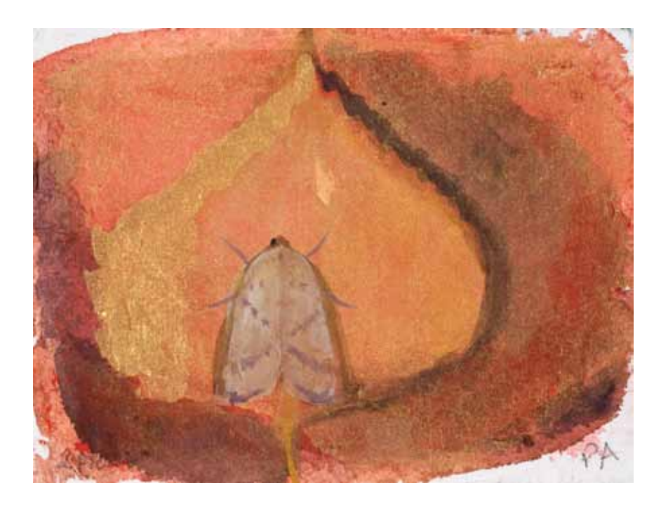
Passenger Moth, watercolor and gouache on paper, 4 x 6 inches Coyote Night Fire, oil on canvas, 46 x 36 inches (left)