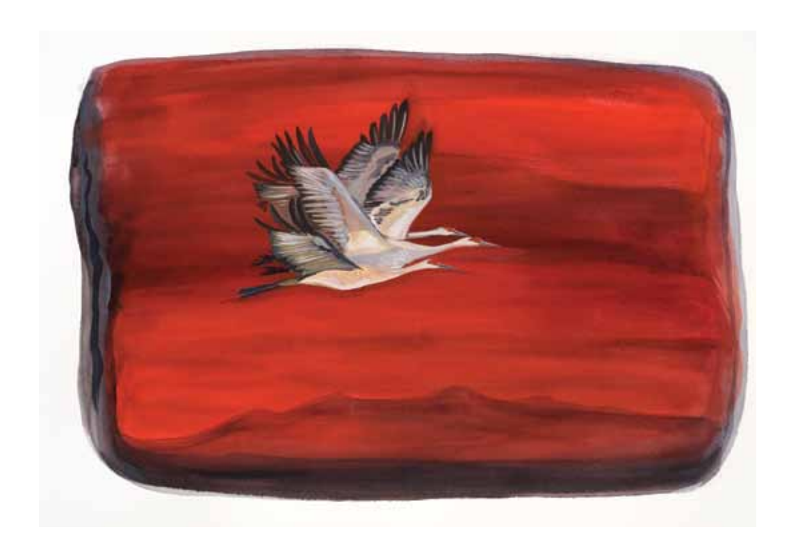
Family of Cranes, watercolor and gouache on paper, 22 x 30 inches