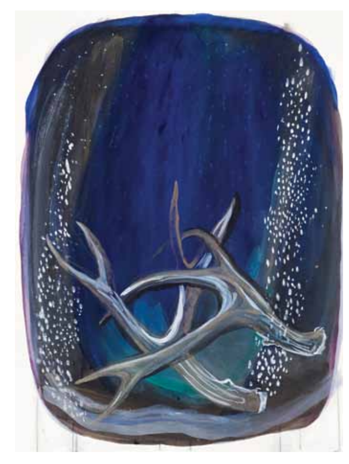
Antlers and Snow, watercolor and gouache on paper, 30 x 22 inches New Year Stag, watercolor and gouache on paper, 30 x 22 inches (left)