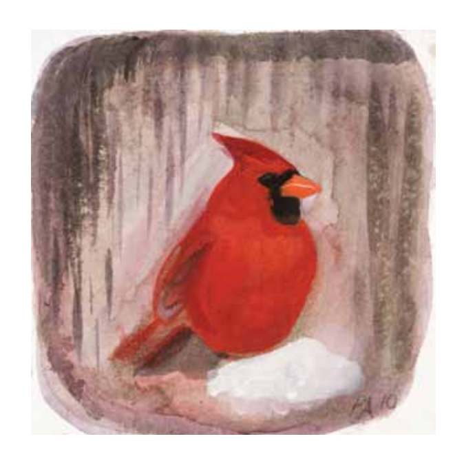
Childhood's Bird, watercolor and gouache on paper, 6 x 6 inches Flickers' Flight, watercolor and gouache on paper, 30 x 22 inches (detail, left)