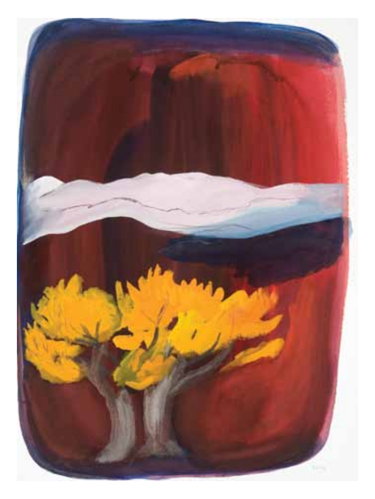
Last October, watercolor and gouache on paper, 30 x 22 inches