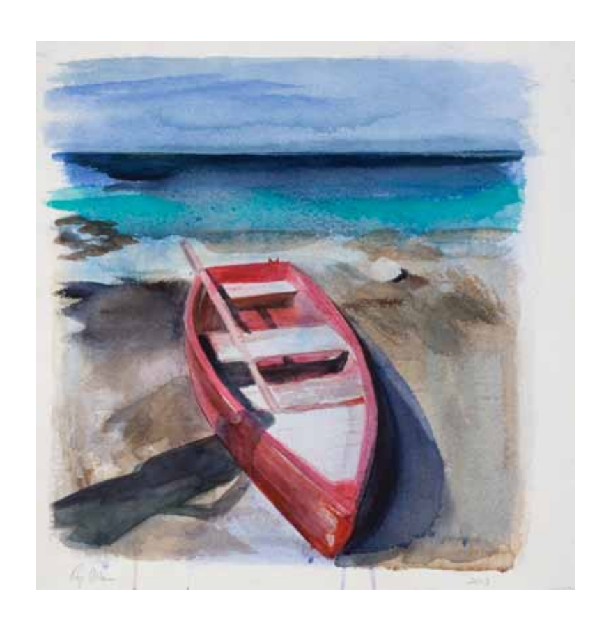
Old Beached Boat, watercolor on paper, 23 x 23 inches The Jays and Seed, oil on canvas, 11 x 14 inches (right)