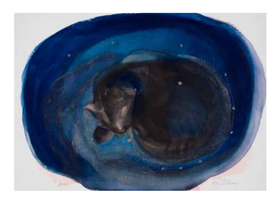
Constellation of the Cat, watercolor on paper, 14 x 19 3/4 inches Green Tree, Bluebells, oil on canvas, 48 x 48 inches (right)