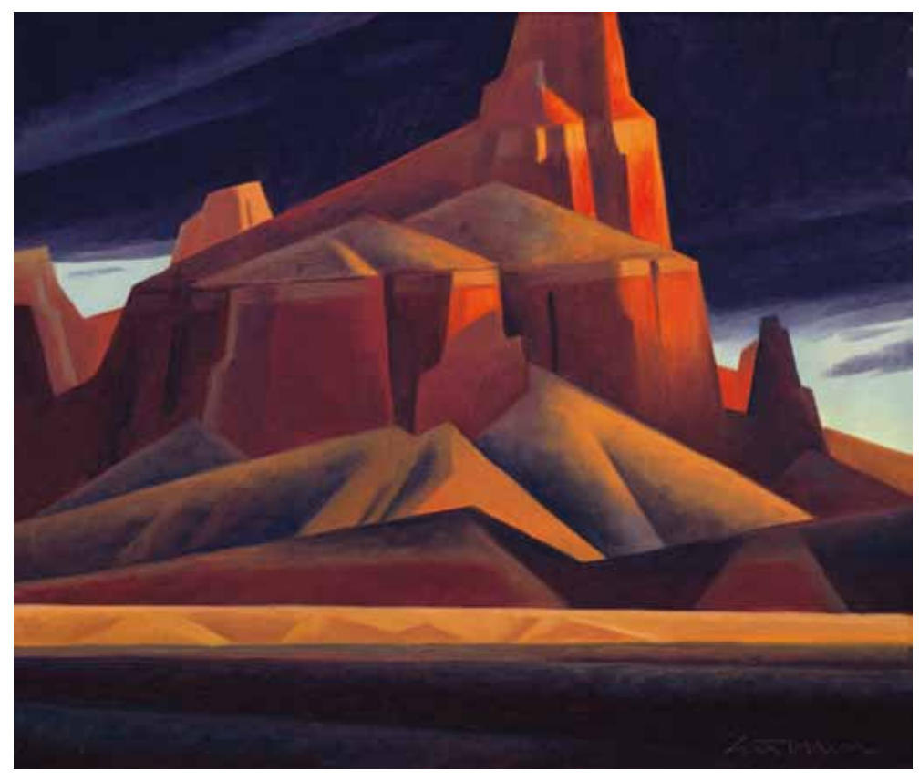
Red Monument, d.2011, oil on linen, 16 x 20 inches Desert Lake, d.2011, oil on linen, 22 x 22 inches (opposite page)