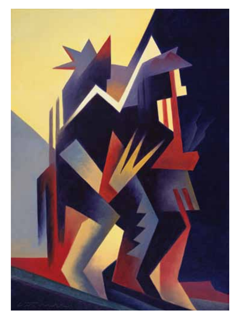
Light into Dark, d.2011, oil on linen, 22 x 16 inches