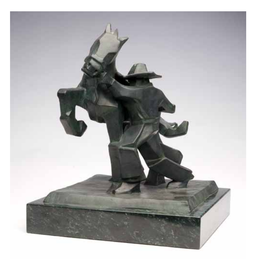
Sidestepper, d. 2009, number 30, bronze, 15 X II X II inches