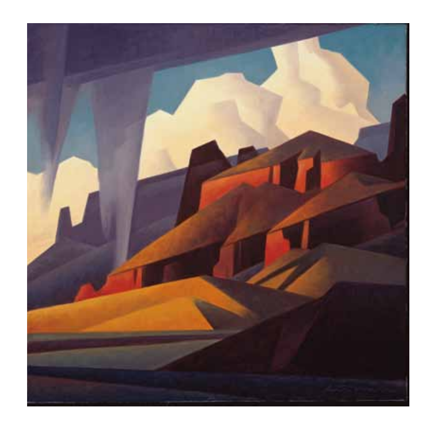
Ascending Mesas, d.2011, oil on linen, 22 x 22 inches Rain Veil, d.2011, oil on linen, 36 x 36 inches (opposite page)