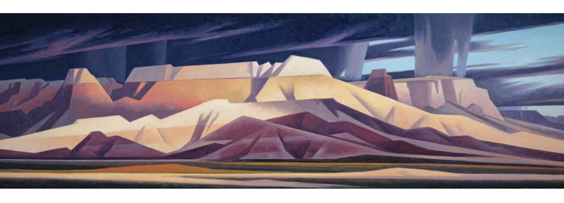
Shaded Desert, d.2011, oil on linen, 20 x 64 inches