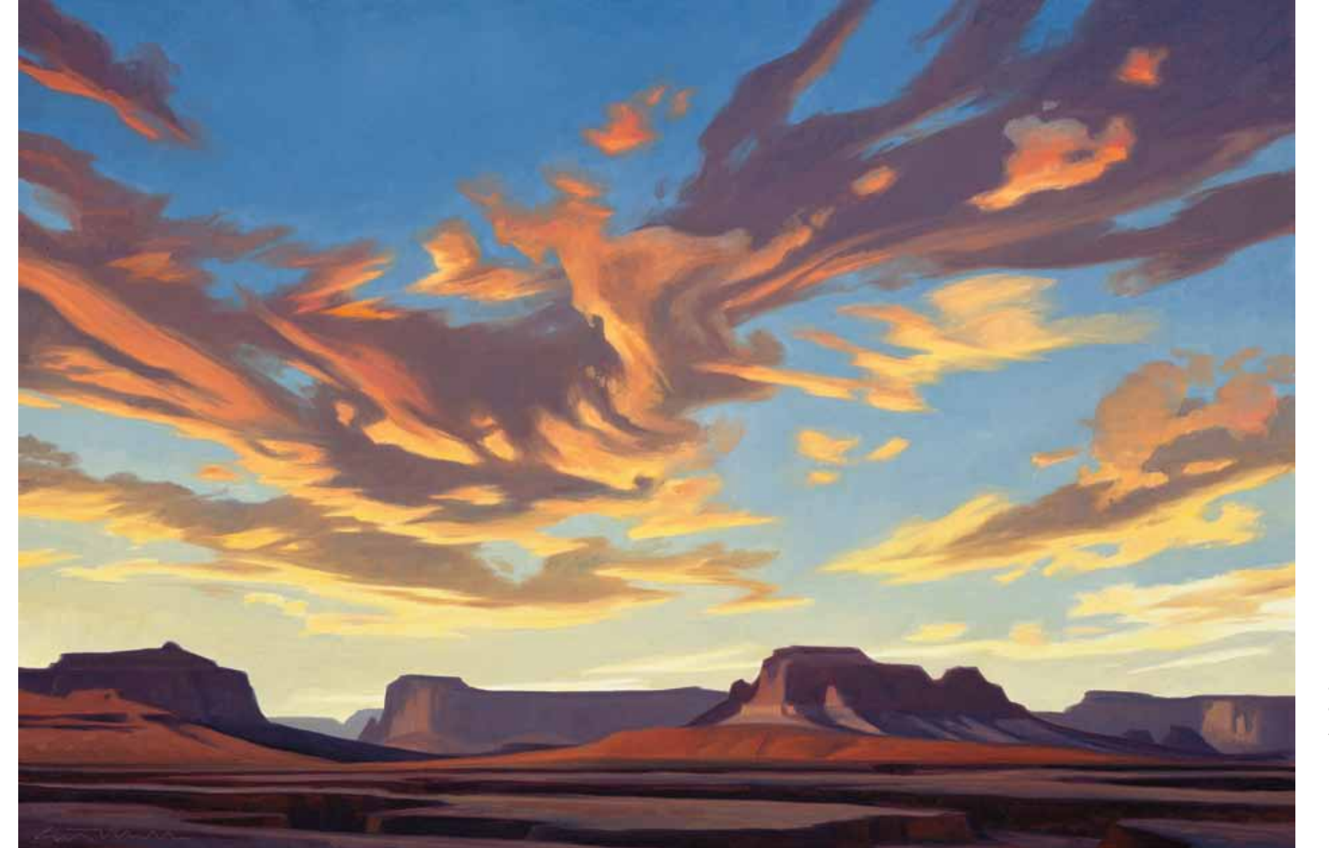
Spiral Sundown, d.2011 oil on linen 44 x 56 inches