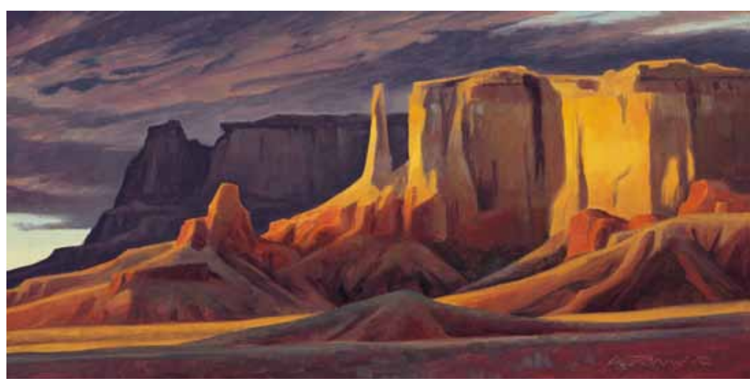
Yellow Mesa, d.2010, oil on linen board, 10 x 20 inches Drywash, d.2011, oil on linen board, 12 x 12 inches (opposite page)